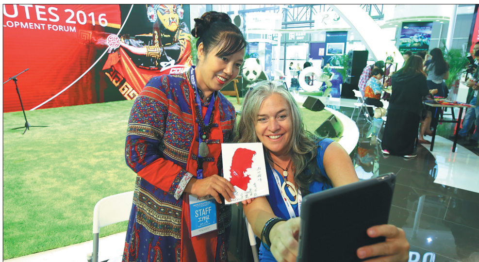
A foreign delegate at World Routes shares a light moment with an ethnic group delegate from Sichuan.