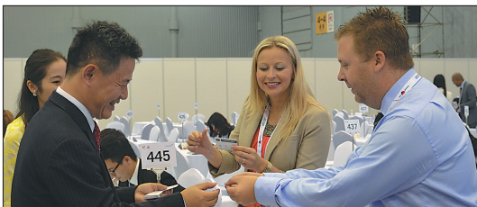
Delegates have one-on-one meetings at World Routes 2016 in Chengdu, Sichuan province, on Sept 25.